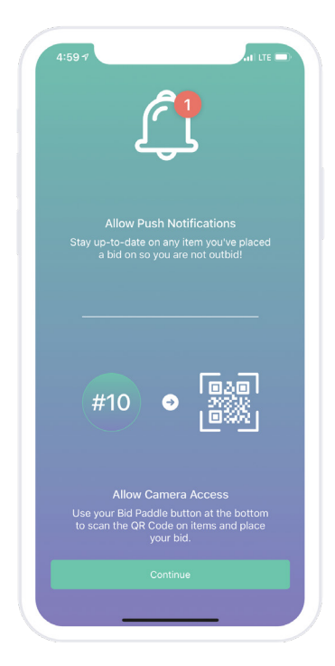
Allow push notifications and camera access so you can receive outbid alerts and use your QR code bid paddle