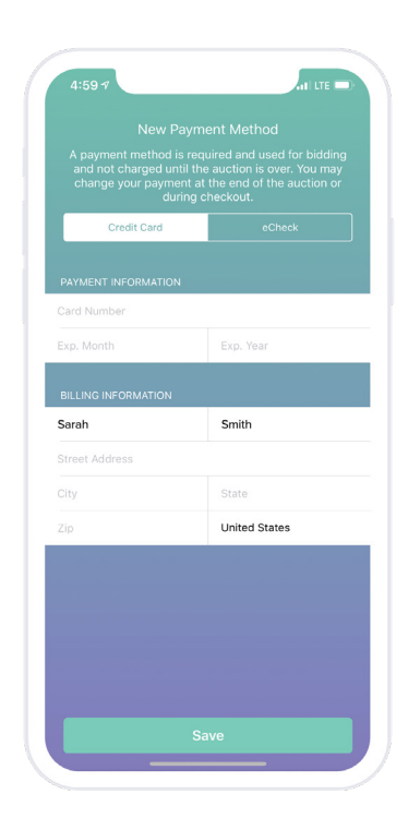
Confirm your payment method or add a new one